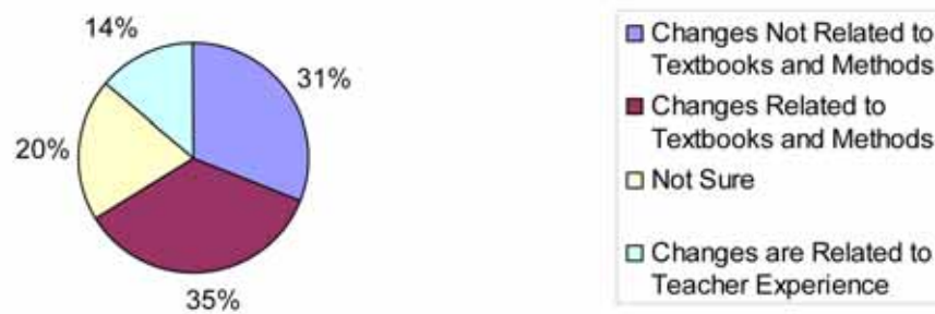
Figure 3. Are the changes in teaching methods related to new textbooks?